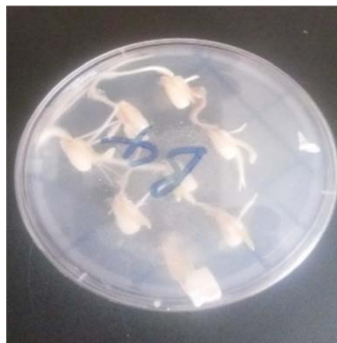
Figure 6. Growth of seedlings of maize under gravity.

The above Figures 5 & 6 shows the radicle and the plumule emergence and elongation of seeds. Figure 5 shows the growth of seeds that was clinorotated and longer in plumule and radicle compare to Figure 6 which is under gravitational force influence within the same period of time.