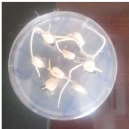
Figure 5. Growth of a clinorotated seedlings of maize.

Figures 5 and 6 show the growth difference between gravity influence and microgravity influence.